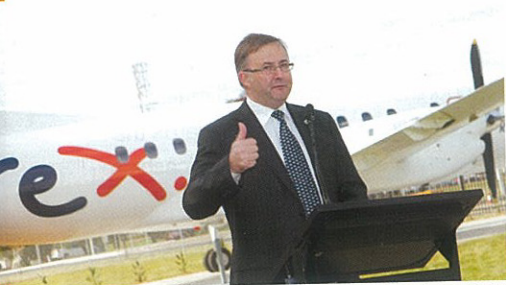
The Hon. Anthony Albanese MP all thumbs up for Rex and AAPA

As AAPA grows beyond the immediate needs of supplying Rex with pilots to service the local regional and domestic air routes, it will look to train pilots for airlines from across the world to contribute to the broader supply of qualified pilots internationally. In doing so, AAPA opens up a vast range of opportunities such as tourism which will add to the economic stimulation in Wagga Wagga.